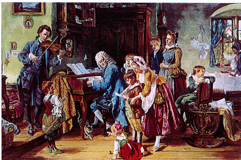
ABOVE: A romanticized 19th-century impression of the Bach family at their morning prayers.

By the time of Bach's death, musical fashions were fast changing, and his music was perceived as antiquated. During his lifetime he had been more celebrated as an organist than as a composer. Unlike Mozart or Beethoven, he had little posthumous influence until Mendelssohn rediscovered his choral masterpieces in the 19th century, and his works began to be performed once more. He is now revered as one of the greatest of all composers.